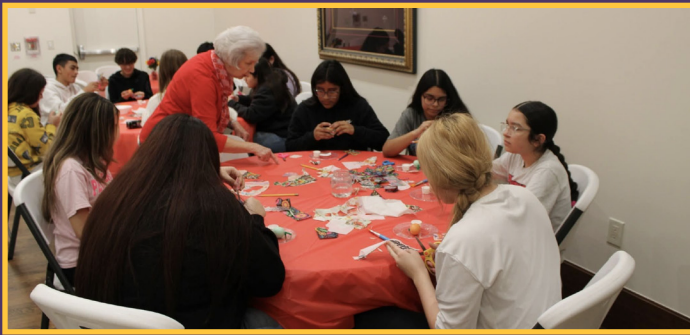
Pettus 8th Grade