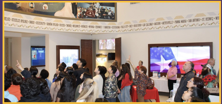
Karnes City 7th Grade