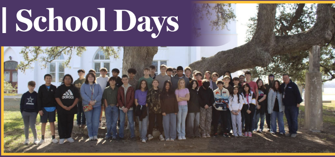
Yorktown 7th Grade