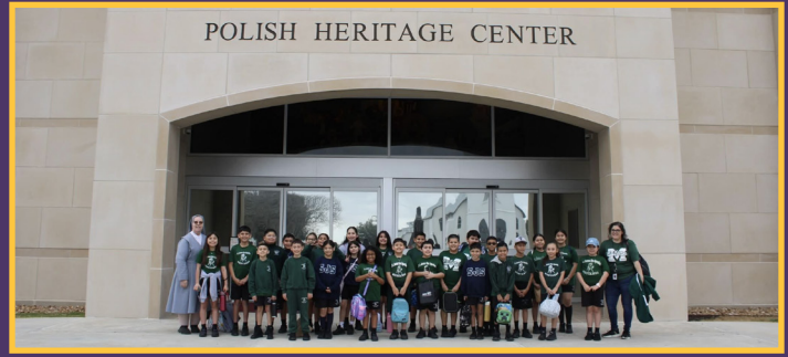
St. James Apostle 4th Grade